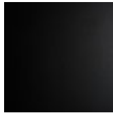
OP17 matt black