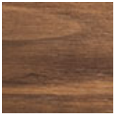
NC walnut canaletto