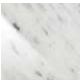
BC polished white Carrara