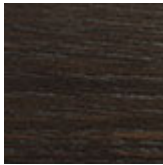
RB burned oak